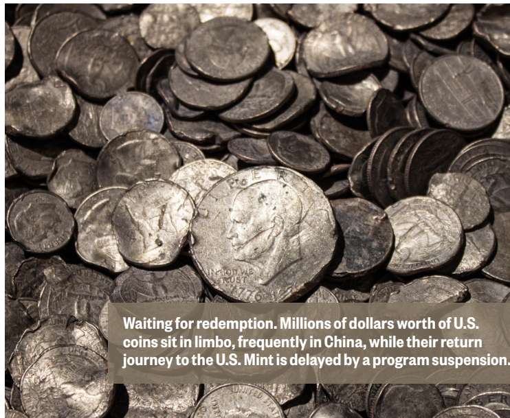
Waiting for redemption. Millions of dollars worth of U.S. coins sit in limbo, frequently in China, while their return journey to the U.S. Mint is delayed by a program suspension.

In November 2015, to ensure the integrity of U.S. coinage, the Mint suspended the buyback program for a period of six months to assess the security and safeguard protocols put into place. Since the suspension, coin recyclers in the United States and overseas have expressed serious concerns about the resumption of the program and question