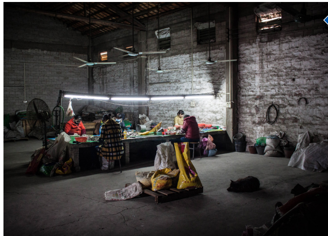
Hand sorting. Fewer than a dozen trained workers can sort through some 2 tonnes to 3 tonnes of coins each day, quickly dividing global coins by country and denomination.