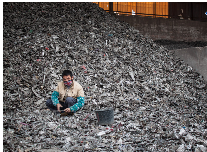
Buried treasure. Family owned scrap operations in China look through shipping containers of mixed nonferrous metal every day.

Reclamation chain. Shipments of zorba and other mixed metal waste pass through a series of screening and flotation techniques before being hand sorted by metal grade. Coins go to coin recyclers, while the other metals will be grouped and either traded or melted and cast into ingots.