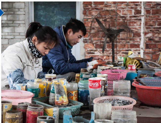
Piling up. While other countries continue to buy back their mutilated currency, U.S. coins valued in excess of $50 million have accumulated in scrap facilities throughout China since March 2015.