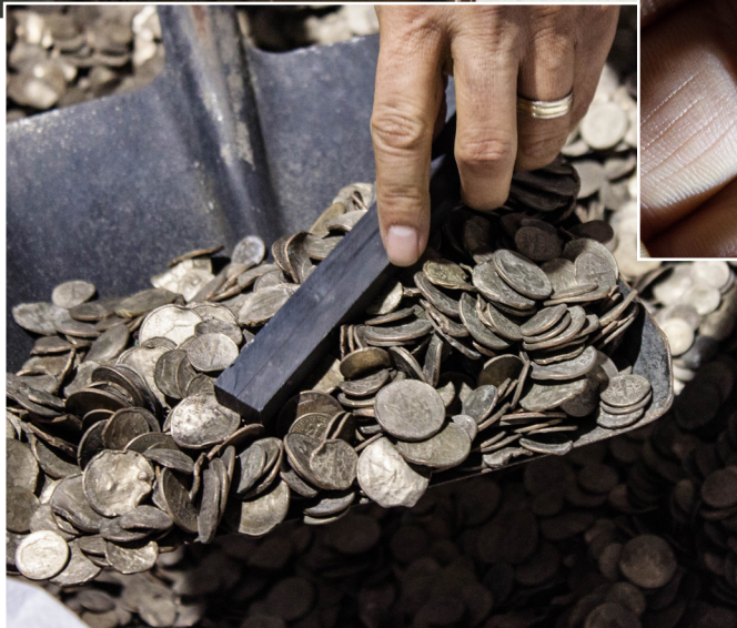
Unsealed. Wealthy Max Ltd. publicly opened and sampled 13 tonnes of mutilated U.S. coins in Hong Kong. The pennies, dimes, quarters and half dollars come from piles of metal generated by automotive shredders and via incinerated waste streams.